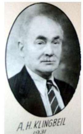
Kroehler Furniture Manufacturing Co.